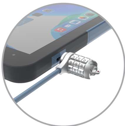
Safe and secure