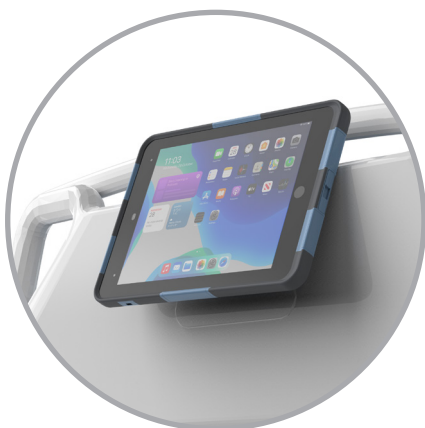
Clamp onto bed rails